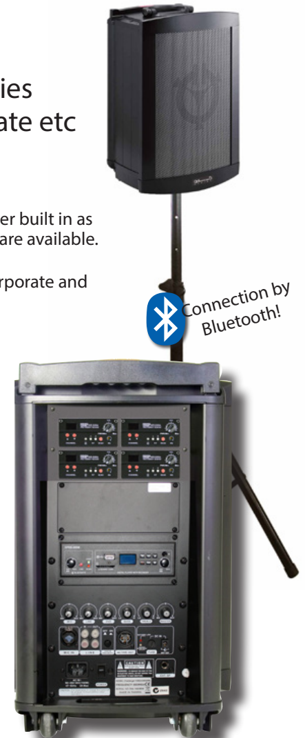
CHALLENGER 1000-D(BD) Shown with four wireless microphone receivers, bluetooth receiver and digital recorder.